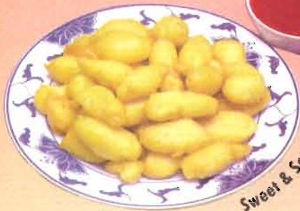
Sweet & Sour Chicken