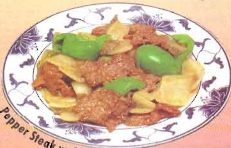
Pepper Steak w. Onion

FREE Crab Rangoon or Soup for Order Over $20