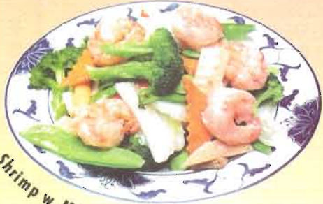
Shrimp w. Mixed Veg.