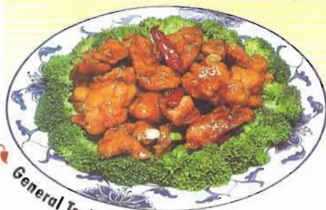
General Tso's Chicken