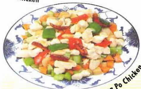
Kung Po Chicken