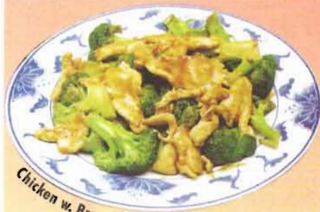
Chicken w. Broccoli