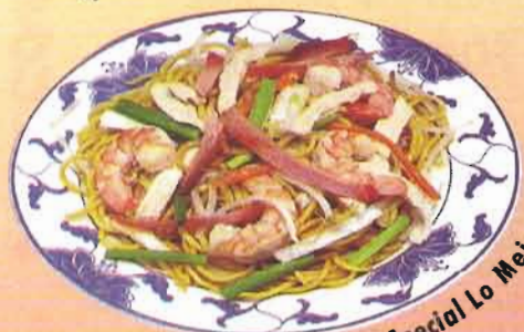
House Special Lo Mein