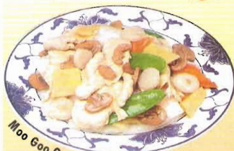
Moo Goo Gai Pan